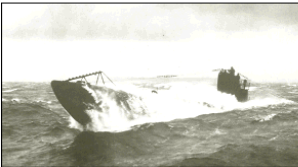
A German U-boat prowls an angry sea, 1916

In February 1917, with U-boats available in quantity, the Germans again declared their policy of unrestricted submarine warfare. This time not only allied but neutral ships (such as those of the U.S.) would be sunk on sight. It was a big gamble. The Germans knew it would bring America into the war. But, they reasoned they could starve the Brits out first. It was a gamble they almost won. By April, when America declared war, Britain was almost on its knees. Over 1,030 merchant ships had been sunk and Britain was only six weeks away from starvation. The introduction of the escorted convoy helped saved the day. Ship losses dropped dramatically and the supply route from America to Britain began to flow.