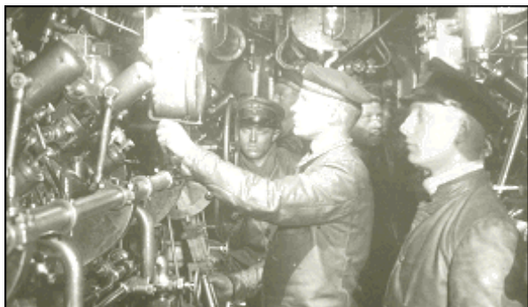
Cramped quarters: a U-boat crew mans its stations

"I saw that the bubble-track of the torpedo had been discovered"