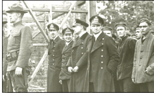
A U-boat crew enters a Georgia prison camp, 1918

P rior to World War I, prevailing naval opinion considered the submarine an ineffective weapon for blockading an enemy country. Submarines, filled with exposed piping and crammed with machinery, had no space to take prisoners aboard. Additionally, the submarine could never carry enough sailors to provide crews to man captured ships. Therefore, the submarine was considered a useless weapon against civilian shipping.