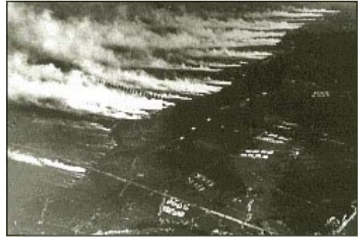
French gas attack on German lines, Belgium, 1916

The First World War saw the introduction of many new technologies to the art of killing one's enemy: the machine gun, the tank, the airplane, the zeppelin, and gas to name a few. Among these, gas was probably the crudest, certainly the most capricious - a change in wind direction could spell disaster. Initially, gas cylinders were simply placed along the front lines facing the enemy trenches. Once the wind was deemed favorable, the cylinders were opened and the gas floated with the breeze, carrying death to the enemy. Later, gas was packed into artillery shells and delivered behind enemy lines. No matter the method of delivery, its impact could produce hell on earth. Chlorine and phosgene gases attacked the lungs ripping the very breath out of its victims. Mustard gas was worse. At least a respirator provided some defense against the chlorine and phosgene gases. Mustard gas attacked the skin - moist skin such as the eyes, armpits, and groin. It burned its way into its victim leaving searing blisters and unimaginable pain.