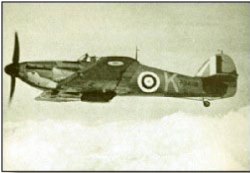
The Hawker Hurricane flown during the Battle of Britain

It was really a terrific sight and quite beautiful. First they seemed just a cloud of light as the sun caught the many glistening chromium parts of their engines, their windshields, and the spin of their airscrew discs. Then, as our squadron hurtled nearer, the details stood out. I could see the bright-yellow noses of Messerschmitt fighters sandwiching the bombers, and could even pick out some of the types. The sky seemed full of them, packed in layers thousands of feet deep. They came on steadily, wavering up and down along the horizon. 'Oh, golly,' I thought, 'golly, golly . . .'