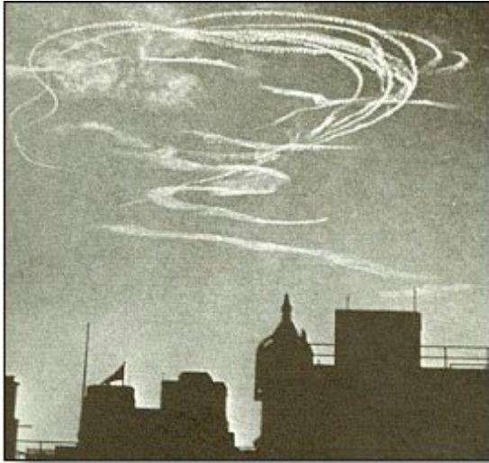
A Londoner's view of the air war - the vapor trails mark the twisting turns of the combatants. June 1940

I turned away again and streaked after some distant specks ahead. Diving down, I noticed that the